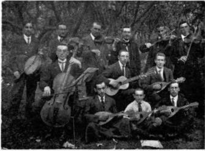
"Maccabi" orchestra (1916)