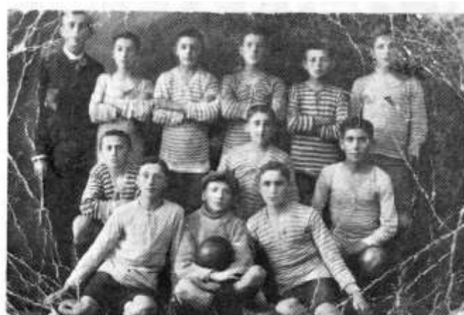
Soccer group "Bar-Kochba" (1923)