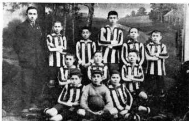
Sports-club "HaGvura" ("Courage") (1926)

The club has conducted a variety of activities in all areas of sports. In particular, it excelled in the gymnastics section with its gifted instructor Zajde. The section has often organized public demonstrations and showed its achievements. The J.A.G.S. also had its own orchestra.