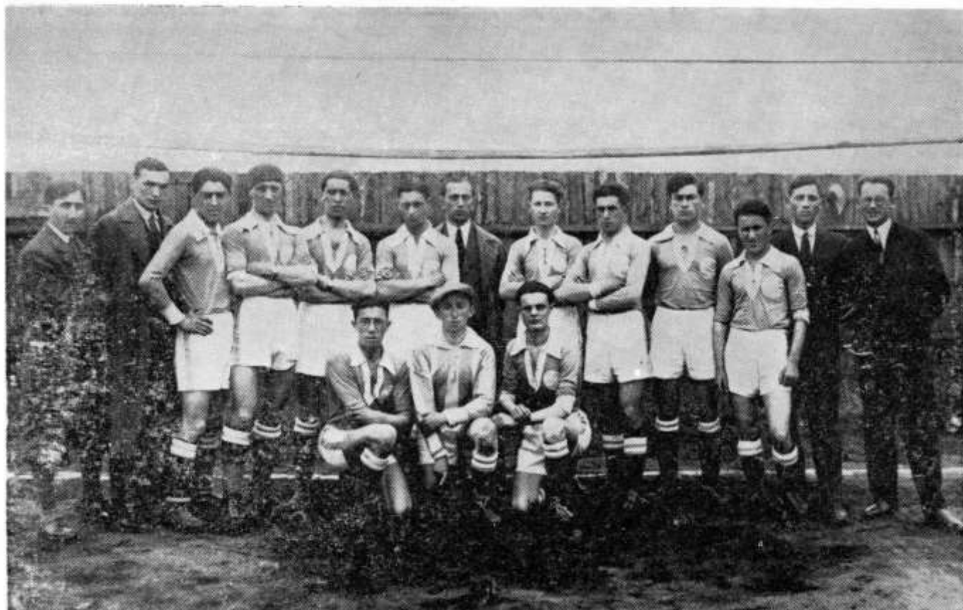
Soccer players of " Maccabi " (1932)