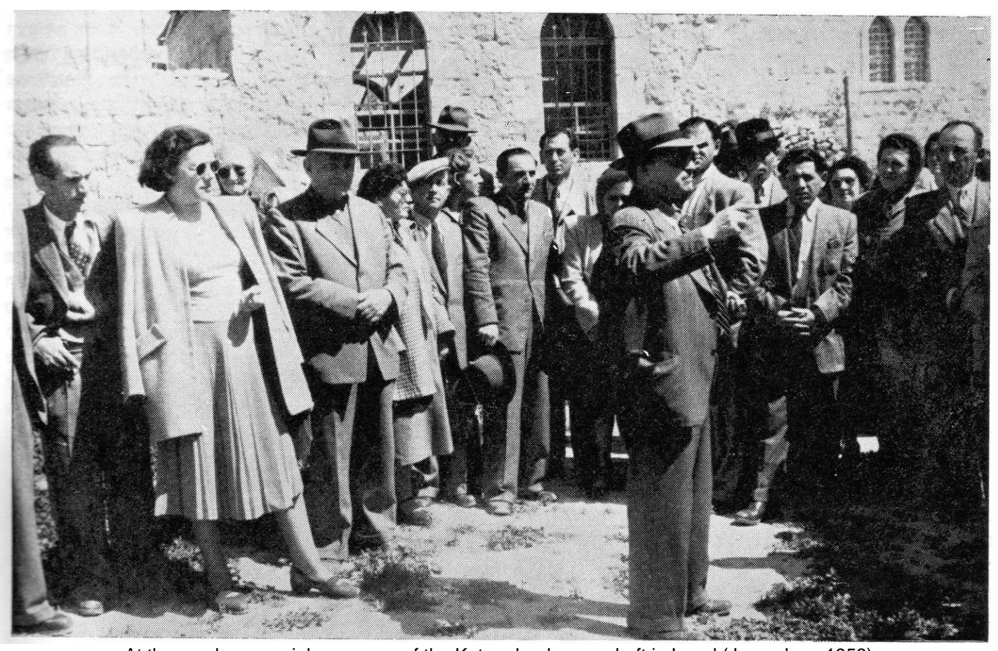
At the yearly memorial ceremony of the Kutner landsmanschaft in Israel (Jerusalem, 1958)