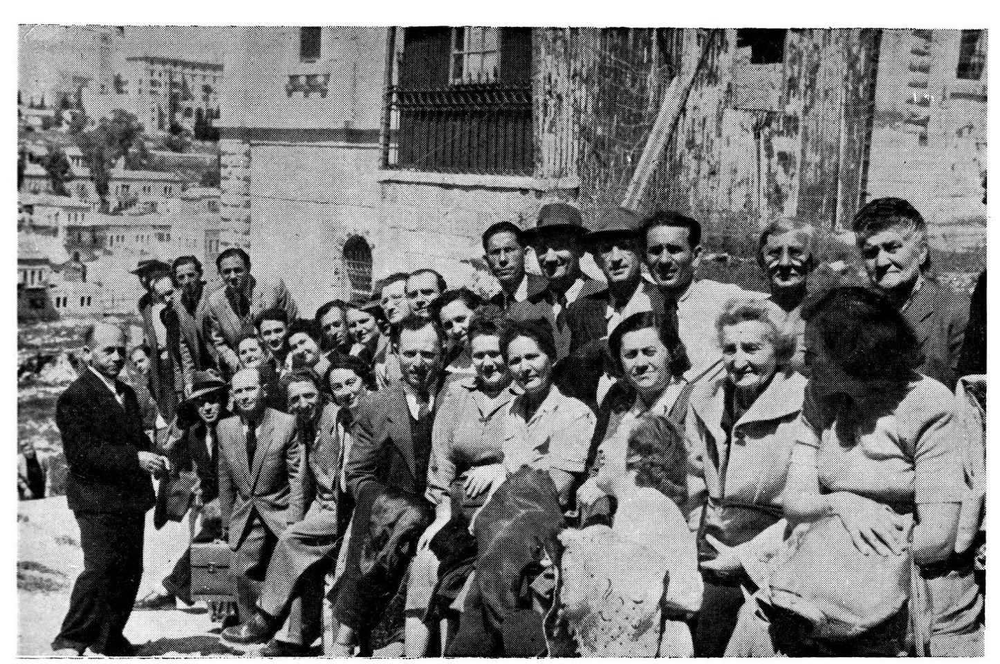
Former residents of Kutno in Israel at the memorial ceremony in Mount Zion in Jerusalem (1958)