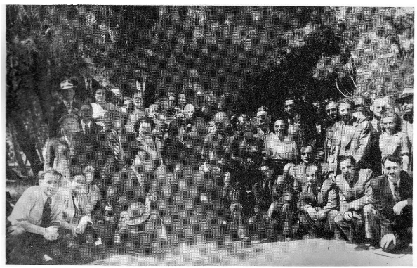
At the annual memorial ceremony of the organization of former Kutno residents in Israel (Jerusalem, Mount Zion, 1958)