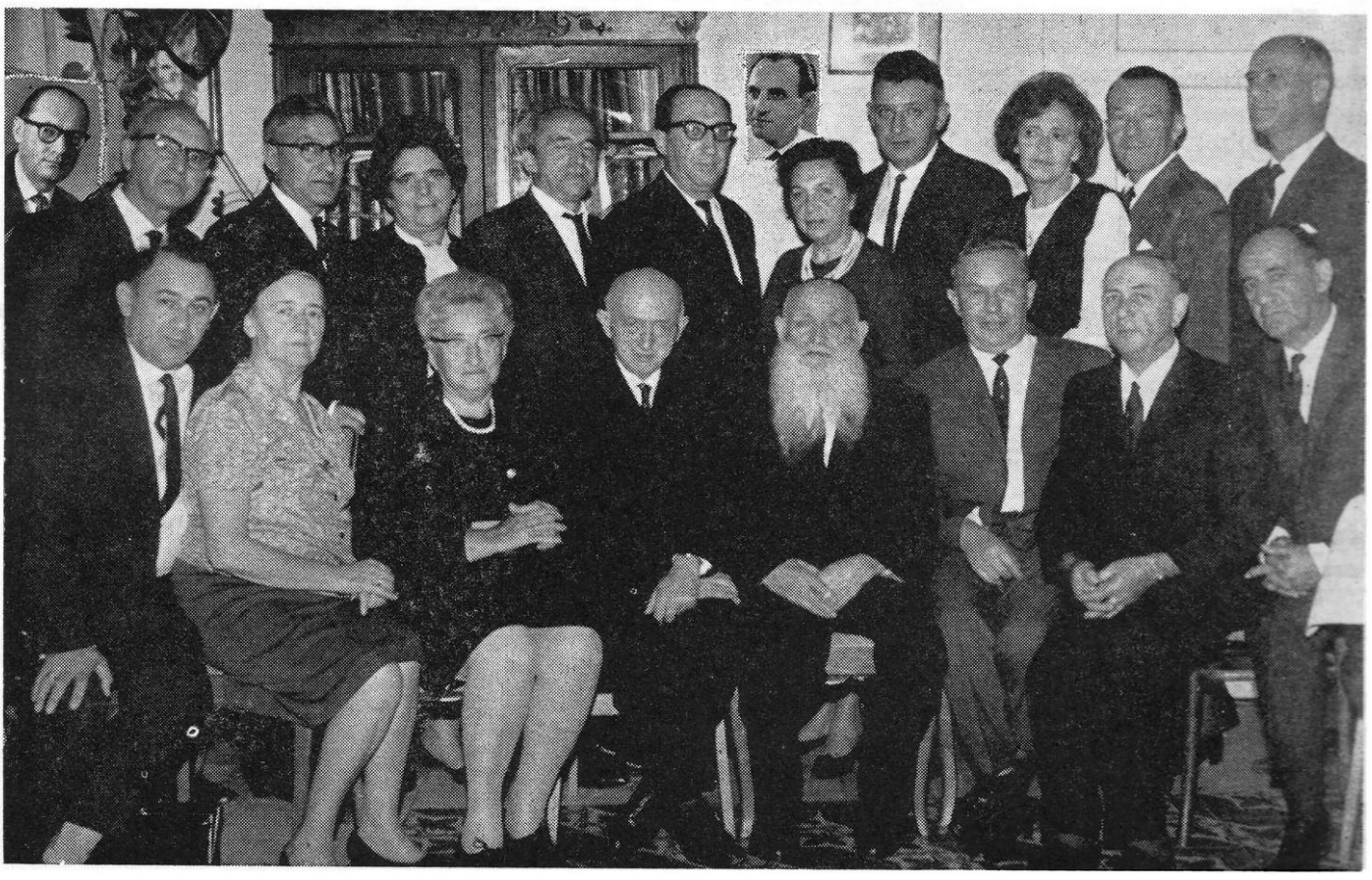
Top: part of the annual memorial ceremony of Kutners in the "House of Pioneers" in Tel Aviv 1963. Bottom: committee of the Kutno former residents' organization in Israel