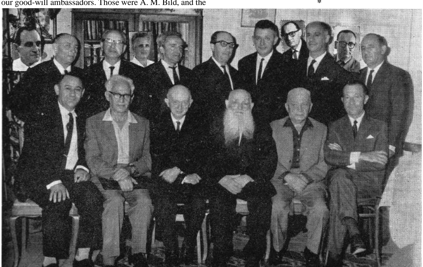
The editorial board members in Israel

A special problem came up, when a request was presented to include in the "Yizkor-Book" for Kutners, other places near our town where Jews were settled. According to the request of the organization in Paris, we decided to enable the perpetuation of the memories of three large Jewish settlements in the Kutno area. Those are Łęczyca, Krośniewice and Dąbrowice, since, in Paris, those three towns are organized together with the former Kutners.