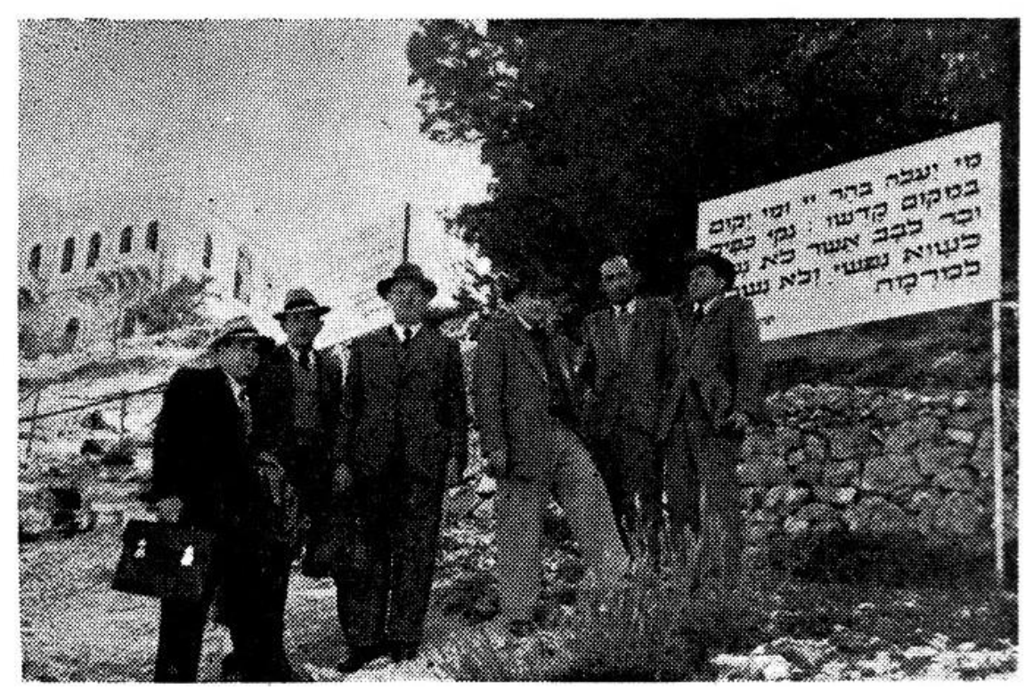
At the entrance of Mount Zion in Jerusalem